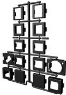
Adapter Plate Set

The TechLink base unit comes with 5 adapter plate sets and 5 modular windows, yielding 10 configurable slots for customization. Its design allows full cable support when loaded and mounted beneath a console's primary surface. Built-in cable management features help consolidate and maintain technology cables.