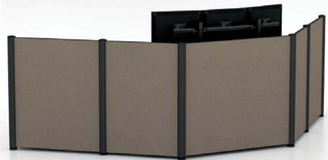
Synergy 1 Console Rear view shown without optional rear-access doors.