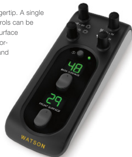
Watson’s Total Comfort System is a single point interface for height adjustment, airflow, heating, and lighting adjustment.

Our consoles include anti-collision sensors on primary surfaces and safety gaps between moving surfaces to ensure risk-free height adjustment.