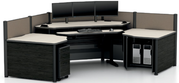
Synergy 1 Console Front view shown with vented technology cabinets.